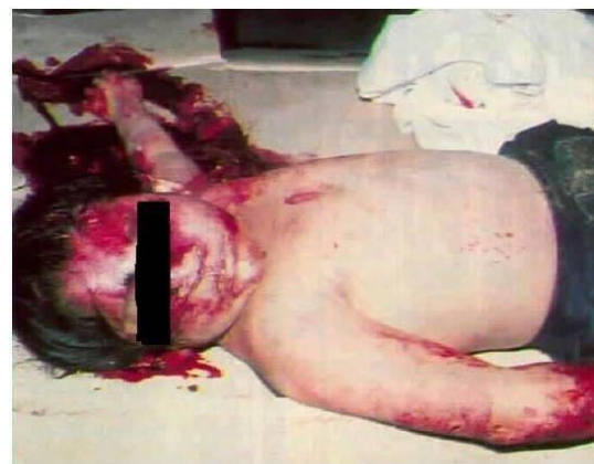
House robbery: child bludgeoned to death, parents murdered

The percentages are pretty alarming. Even though it's an inaccurate way of expressing murder rates, one could argue that almost 10% of white farmers in South Africa have been murdered.